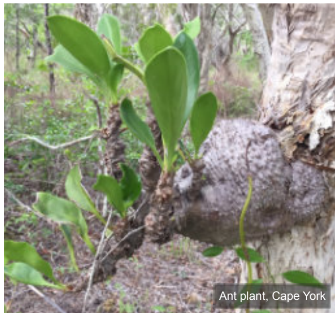
Ant plant, Cape York