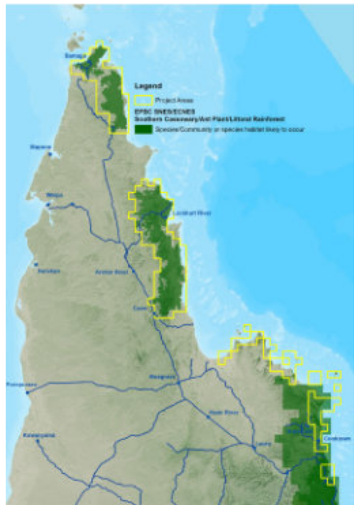
Map indicates the region in which this program takes place, plus the habitat area that the species are likely to occur in Cape York.