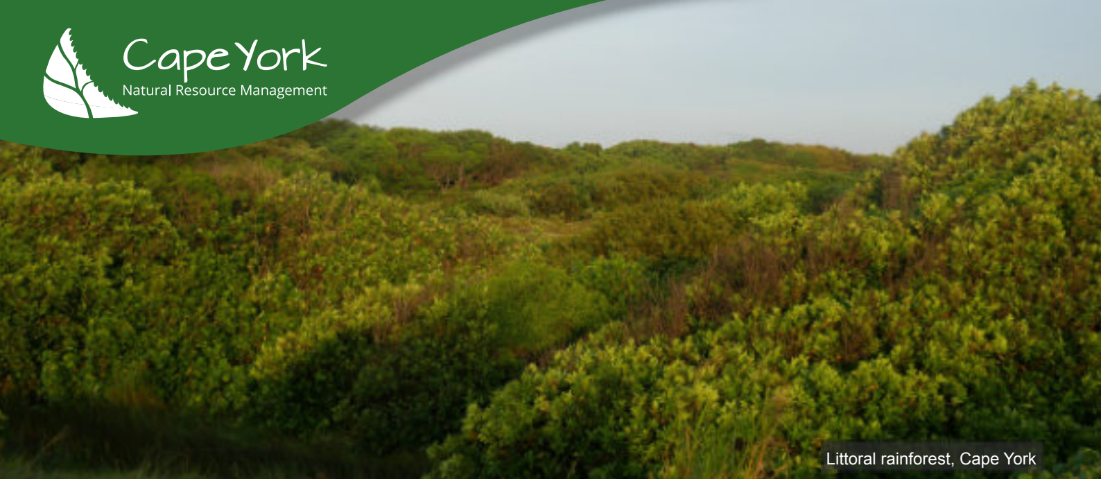
Littoral rainforest, Cape York