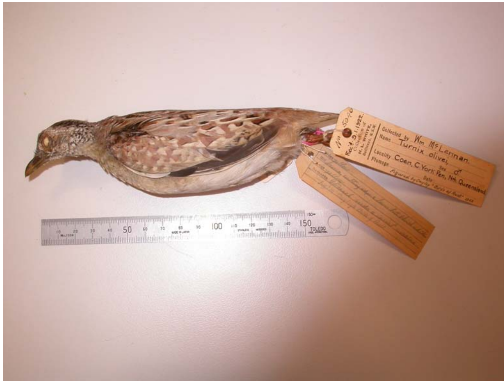
Figure 1. Male Turnix olivii specimen. H.L. White Collection, Museum of Victoria.