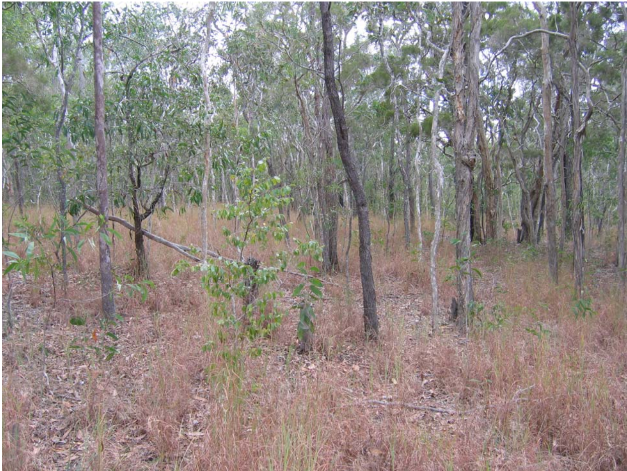
Figure 3. Grassy woodland habitat of the buff-breasted button-quail near Mt Molloy

This plan does not provide spatial information on habitat critical to survival of the species but Actions 1.1 and 1.2 identify a process for this to occur within the early stages of implementation of this plan.