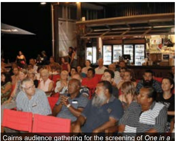
Cairns audience gathering for the screening of One in a Thousand