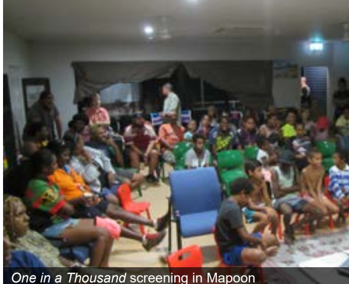
One in a Thousand screening in Mapoo